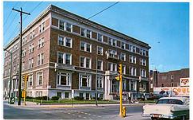
The YMCA circa 1962