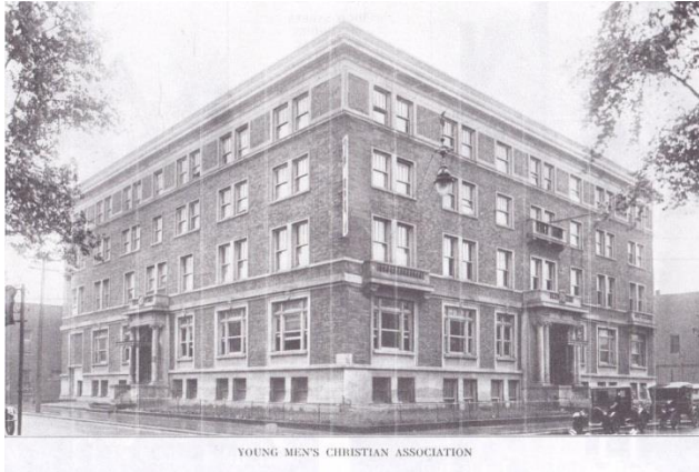
The YMCA circa 1930s

It would be a major injustice to the historical record to discount the influence that this facility has had on Muncie swim history. The downtown Y shaped history by introducing swimming as a basic life skill and introduced hundreds to competitive swimming.