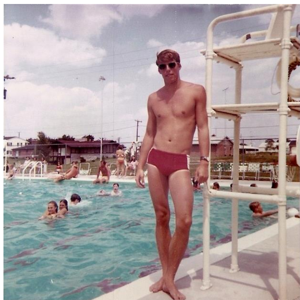
1968 Guard at Catalina Club