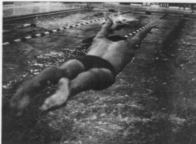
Getting off to a good start is important in swimming. Improving such techniques as